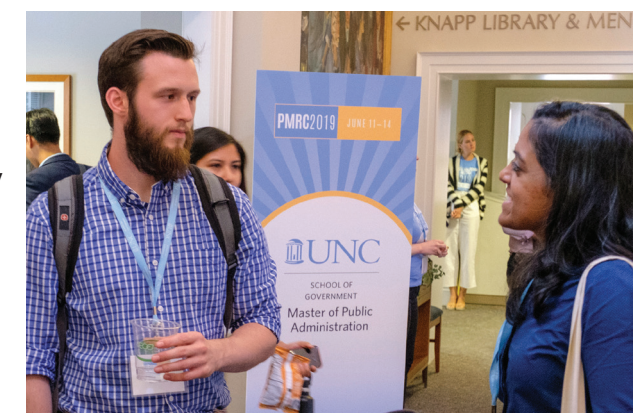
PMRC was the largest multi-day event held at the UNC School of Government.

conference was "superb, excellent, first class, intellectually-stimulating, and fun... It was a complete 'slam dunk' in every way. You have set the bar high for those who follow."