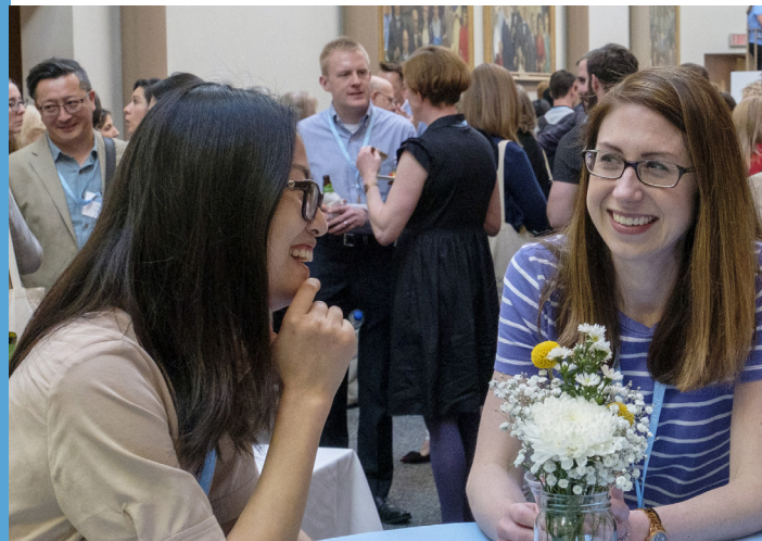
About 450 participants, representing more than 140 institutions and 19 countries, came to the School of Government for PMRC 2019.